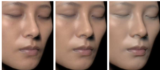
(d) Foundation 4