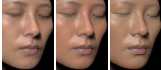
(b) Foundation 2