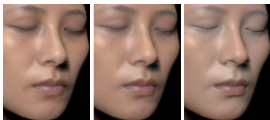
(e) Foundation 5